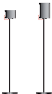
Free Stand I