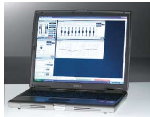
Remote operation via a laptop.