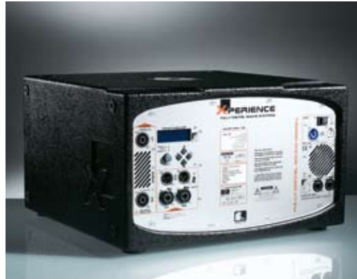
The ultra-compact active subwoofer XS-10 (front and rear view)