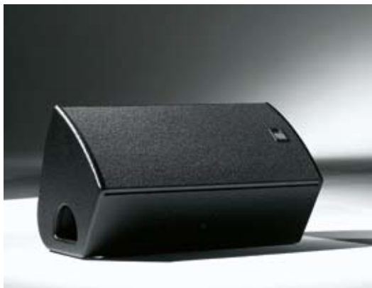
XT-10 – ideal as a monitor.

In the same way as the larger Xperience systems, here users also have the option of selecting almost any Top from the Fohhn range. Tops from the ARC-Series AT-05, AT-06, AT-07 or Linea AL-20 and AL-50 are most suitable for home applications and are available in all RAL colours or with stylish piano finish. A perfectly tuned preset for each Top is stored in the integral speaker database.