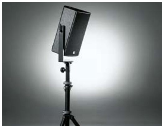
XT-10 directed accurately at the audience.