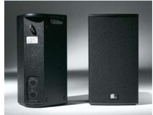
The 8"/1" CD Top XT-10