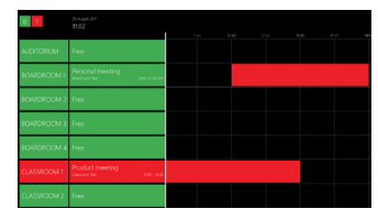
Layout with timeline

Following languages are available for user interface.