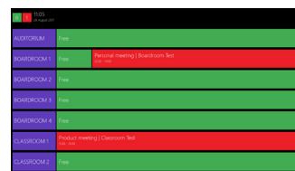
Layout without timeline