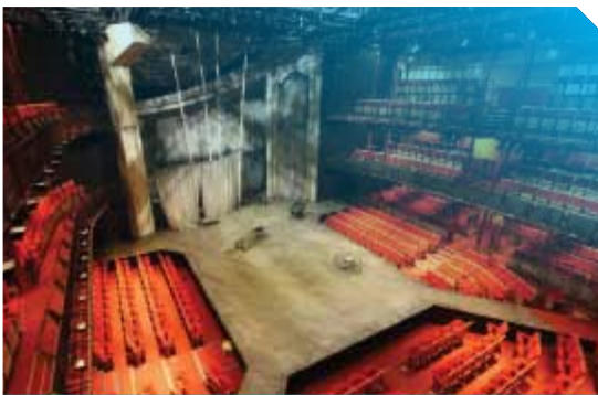
Ampetronic hearing loop installed in Royal Shakespeare Courtyard Theatre, Stratford upon Avon, UK

Ampetronic drivers are CE and Regulatory Compliance Mark (RCM) marked to all relevant safety and EMC standards, and are Nationally Recognized Testing Laboratory, Electrical Testing Laboratory (NRTL ETL) approved for sale in North America.