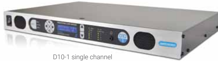
D10-1 single channel output amplifier