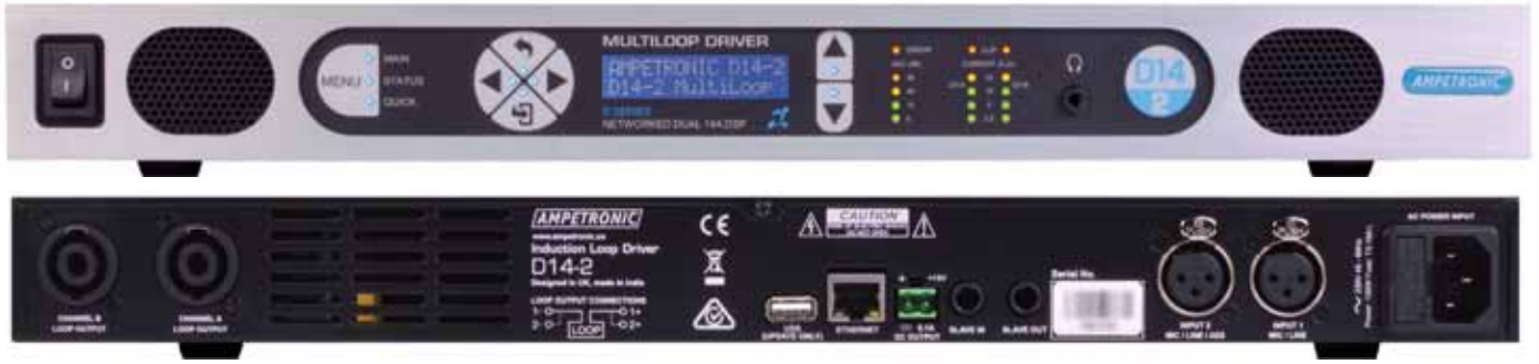
D 14-2 Hearing loop driver