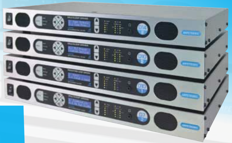
D Series amplifiers - part of the Ampetronic professional range