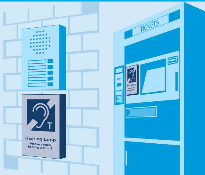
Figure 1: Door Intercom