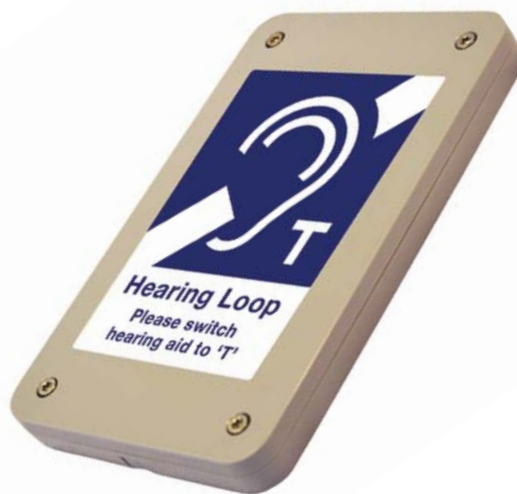
HLS-2C Active Loop Panel